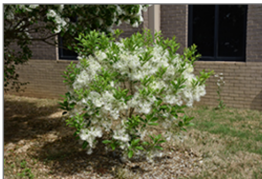
White Knight Fringetree in bloom

White Knight Fringetree will grow to be about 15 feet tall at maturity, with a spread of 10 feet. It has a low canopy with a typical clearance of 1 foot from the ground, and is suitable for planting under power lines. It grows at a slow rate, and under ideal conditions can be expected to live for 70 years or more.