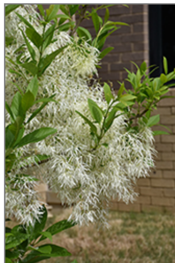
White Knight Fringetree flowers

White Knight Fringetree is recommended for the following landscape applications;