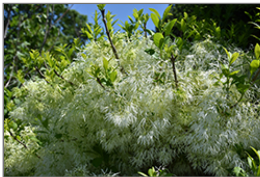
White Knight Fringetree flowers