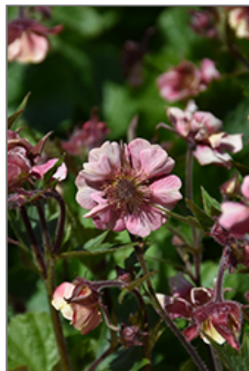
Tempo Rose Avens flowers

Tempo Rose Avens is recommended for the following landscape applications;