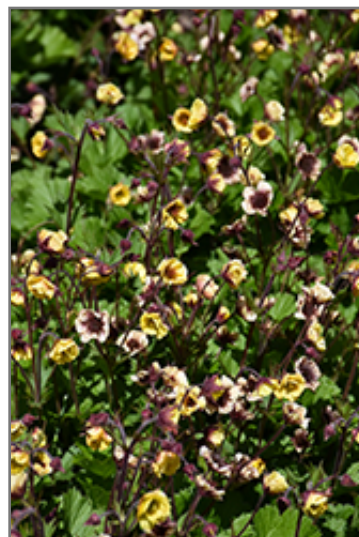
Tempo Yellow Avens flowers

Tempo Yellow Avens is recommended for the following landscape applications;