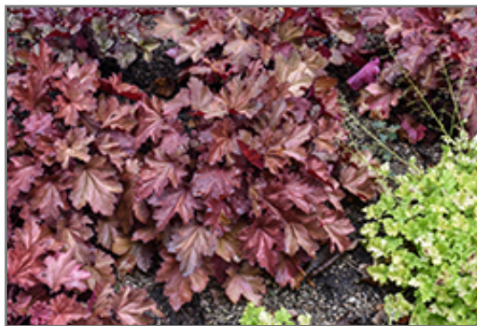
Magma Coral Bells