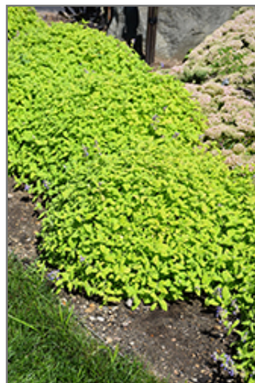
Chartreuse On The Loose Catmint