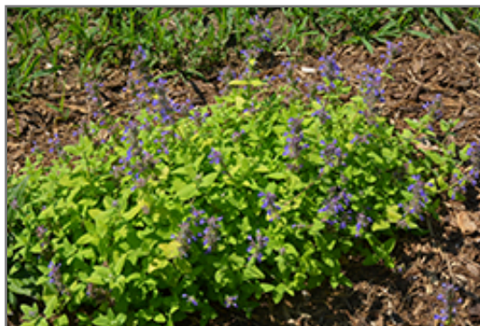
Chartreuse On The Loose Catmint in bloom