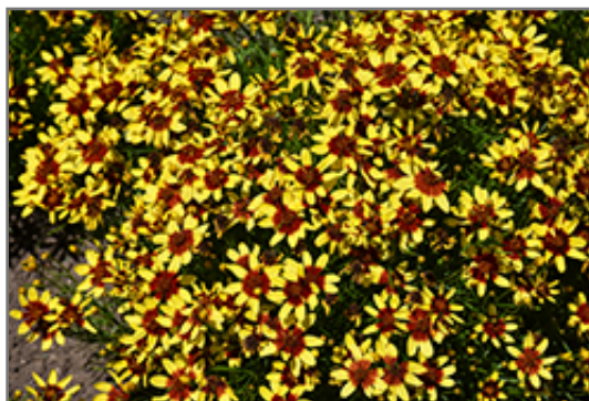
Firefly Tickseed flowers

Firefly Tickseed is recommended for the following landscape applications;