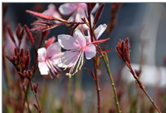
Steffi Blush Pink Gaura flowers

This is a relatively low maintenance plant, and is best cleaned up in early spring before it resumes active growth for the season. It is a good choice for attracting bees and butterflies to your yard, but is not particularly attractive to deer who tend to leave it alone in favor of tastier treats. It has no significant negative characteristics.