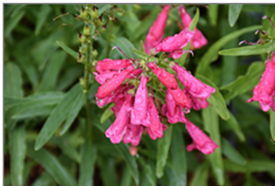
Coral Baby Beardtongue flowers