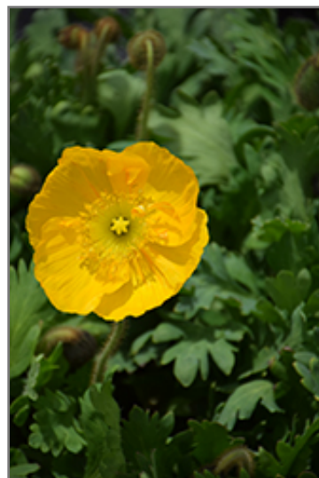
Champagne Bubbles Yellow Poppy flowers

Champagne Bubbles Yellow Poppy is an open herbaceous perennial with tall flower stalks held atop a low mound of foliage. It brings an extremely fine and delicate texture to the garden composition and should be used to full effect.