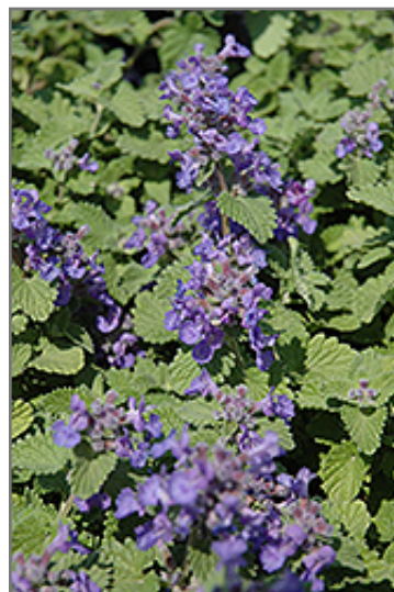
Little Titch Catmint flowers