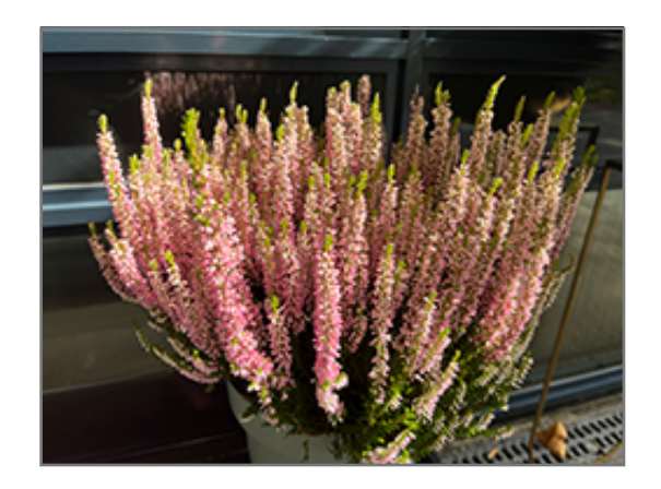
Marlies Heather in bloom

Marlies Heather is recommended for the following landscape applications;