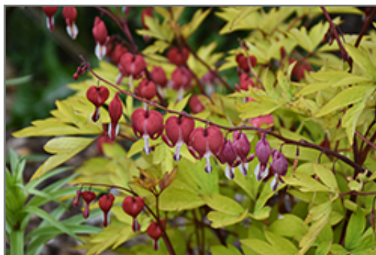
Ruby Gold Bleeding Heart flowers

Ruby Gold Bleeding Heart is recommended for the following landscape applications;