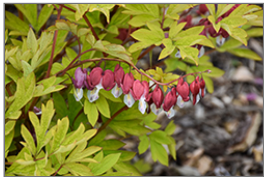
Ruby Gold Bleeding Heart flowers