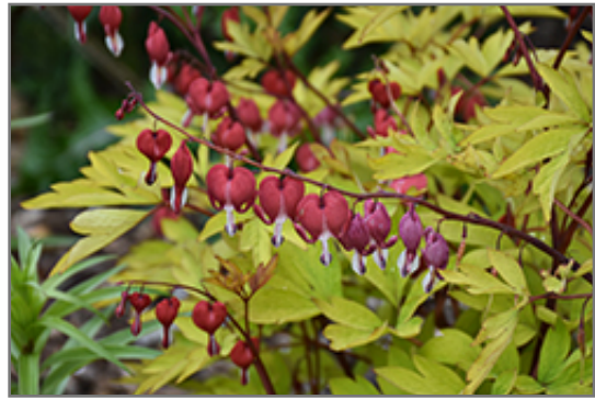
Ruby Gold Bleeding Heart flowers

Ruby Gold Bleeding Heart is recommended for the following landscape applications;