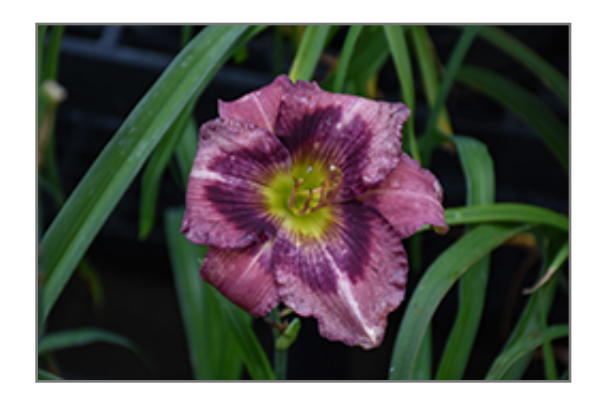
Kansas Kitten Daylily flowers