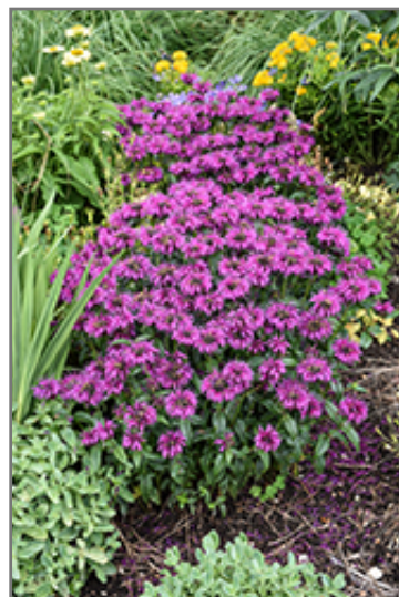
Electric Neon Purple Beebalm in bloom