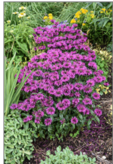
Electric Neon Purple Beebalm in bloom