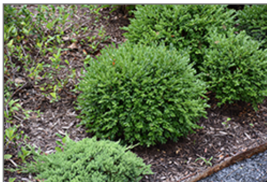
NewGen Liberty Belle Boxwood

NewGen Liberty Belle Boxwood will grow to be about 18 inches tall at maturity, with a spread of 3 feet. It tends to fill out right to the ground and therefore doesn't necessarily require facer plants in front. It grows at a slow rate, and under ideal conditions can be expected to live for approximately 30 years.