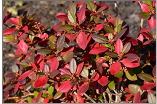
P.J.M. Rhododendron in fall

This shrub does best in full sun to partial shade. You may want to keep it away from hot, dry locations that receive direct afternoon sun or which get reflected sunlight, such as against the south side of a white wall. It requires an evenly moist well-drained soil for optimal growth, but will die in standing water. It is very fussy about its soil conditions and must have rich, acidic soils to ensure success, and is subject to chlorosis (yellowing) of the foliage in alkaline soils. It is somewhat tolerant of urban pollution, and will benefit from being planted in a relatively sheltered location. Consider applying a thick mulch around the root zone in winter to protect it in exposed locations or colder microclimates. This particular variety is an interspecific hybrid.