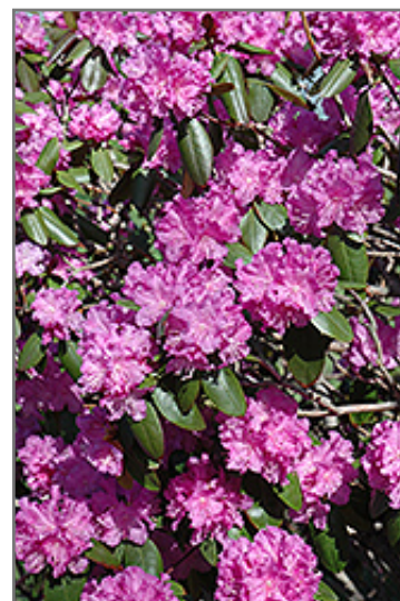
P.J.M. Rhododendron flowers