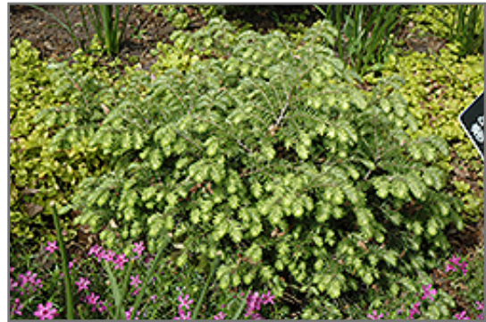
Moon Frost Hemlock

Moon Frost Hemlock is recommended for the following landscape applications;