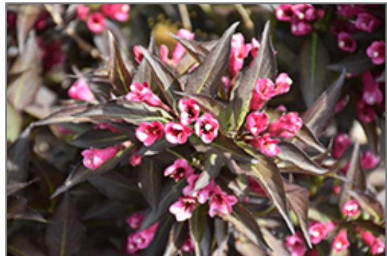
Midnight Wine Weigela flowers