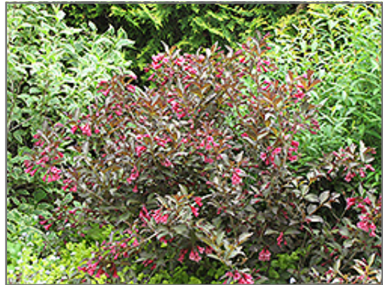
Midnight Wine Weigela in bloom