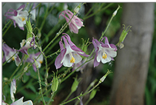
Common Columbine flowers