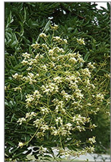
Japanese Pagoda Tree flowers