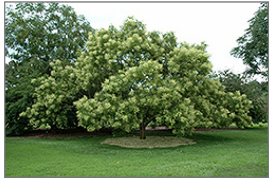
Japanese Pagoda Tree in bloom

Japanese Pagoda Tree is recommended for the following landscape applications;