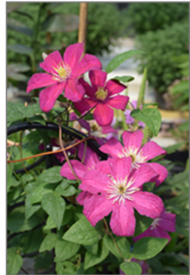
Barbara Harrington Clematis flowers