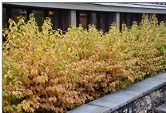
Midwinter Fire Dogwood in fall