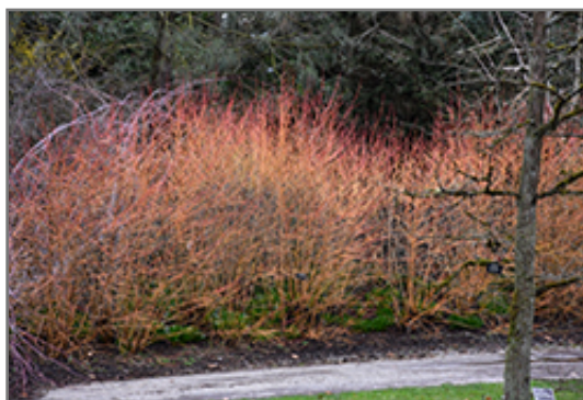
Midwinter Fire Dogwood in winter