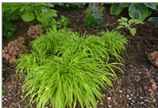
All Gold Hakone Grass