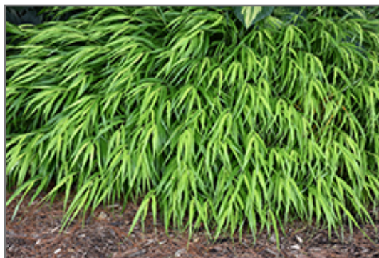
All Gold Hakone Grass foliage