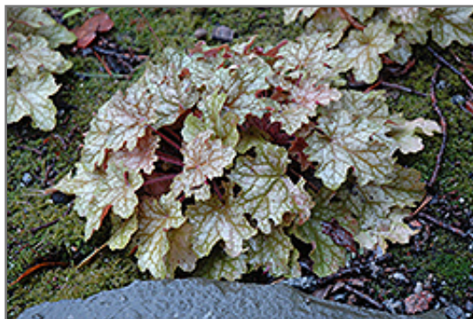
Ginger Ale Coral Bells