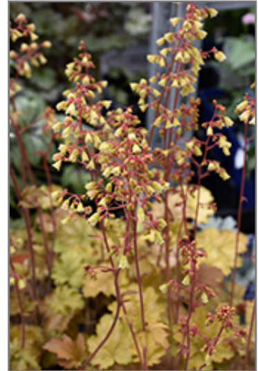
Ginger Ale Coral Bells foliage

* This is a 'special order' plant - contact store for details