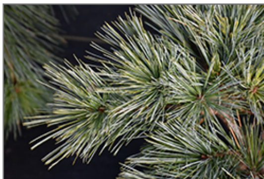
Macopin Eastern White Pine foliage