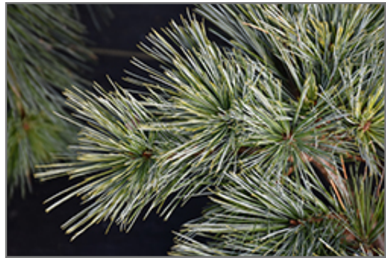
Macopin Eastern White Pine foliage