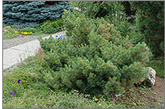
Macopin Eastern White Pine