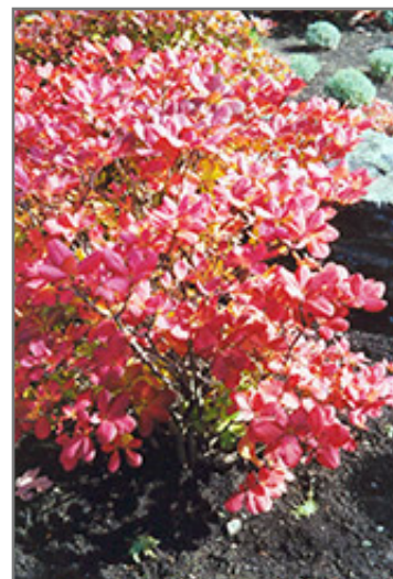
Royal Azalea in fall

* This is a 'special order' plant - contact store for details