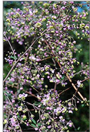
Rochebrun Meadow Rue flowers