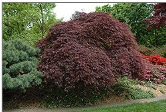
Red Select Cutleaf Japanese Maple