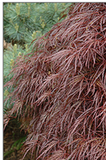
Red Select Cutleaf Japanese Maple foliage

Red Select Cutleaf Japanese Maple is recommended for the following landscape applications;