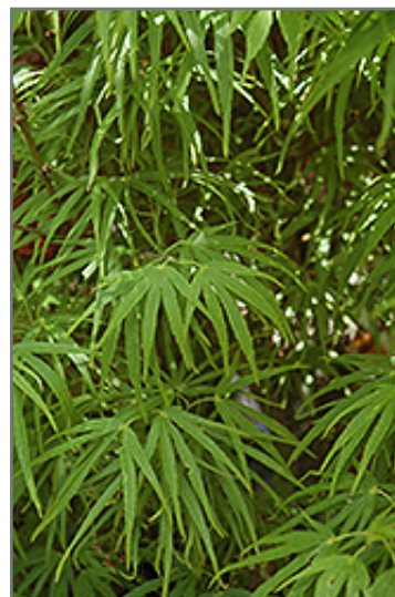
Scolopendrifolium Japanese Maple foliage

Scolopendrifolium Japanese Maple is recommended for the following landscape applications;