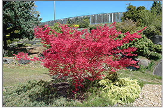
Shindeshojo Japanese Maple in spring

* This is a 'special order' plant - contact store for details