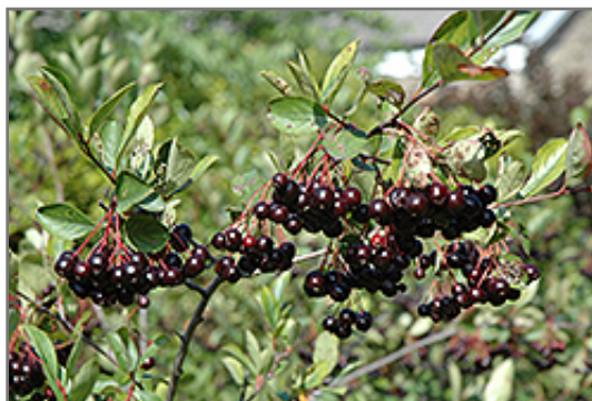
Autumn Magic Black Chokeberry fruit

* This is a 'special order' plant - contact store for details