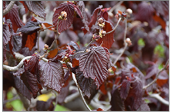
Red Majestic Corkscrew Hazelnut foliage

* This is a 'special order' plant - contact store for details