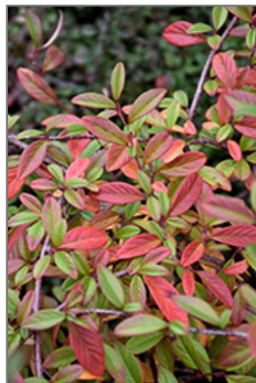
Scarlet Leader Willowleaf Cotoneaster in fall

* This is a 'special order' plant - contact store for details