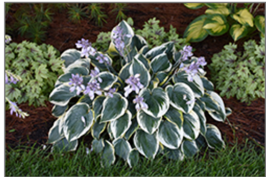
First Frost Hosta in bloom