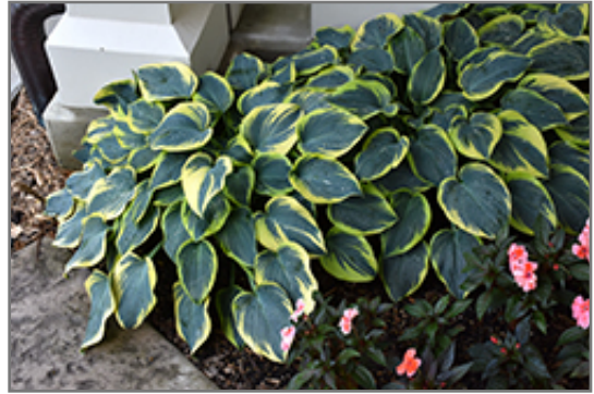
First Frost Hosta

First Frost Hosta will grow to be about 10 inches tall at maturity extending to 18 inches tall with the flowers, with a spread of 3 feet. When grown in masses or used as a bedding plant, individual plants should be spaced approximately 30 inches apart. Its foliage tends to remain low and dense right to the ground. It grows at a medium rate, and under ideal conditions can be expected to live for approximately 10 years. As an herbaceous perennial, this plant will usually die back to the crown each winter, and will regrow from the base each spring. Be careful not to disturb the crown in late winter when it may not be readily seen!