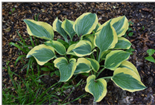
Liberty Hosta