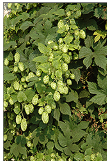
Nugget Ornamental Golden Hops fruit