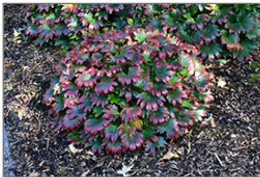
Crimson Fans Mukdenia