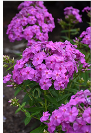
Flame Lilac Garden Phlox flowers

Flame Lilac Garden Phlox is recommended for the following landscape applications;