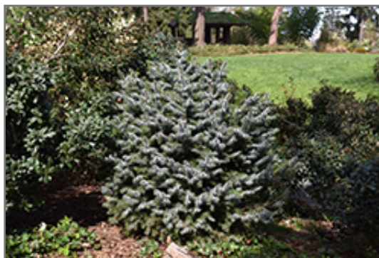
Papoose Dwarf Sitka Spruce