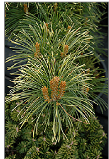
Goldilocks White Pine foliage