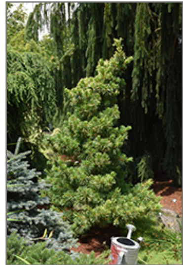
Goldilocks White Pine