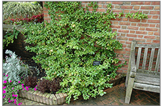
Sarcoxie Wintercreeper