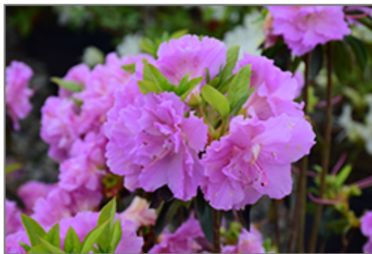
Elsie Lee Azalea flowers