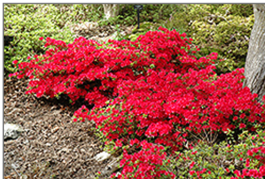
Hino Crimson Azalea in bloom