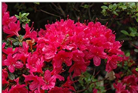
Hino Crimson Azalea flowers

This shrub does best in full sun to partial shade. You may want to keep it away from hot, dry locations that receive direct afternoon sun or which get reflected sunlight, such as against the south side of a white wall. It requires an evenly moist well-drained soil for optimal growth, but will die in standing water. It is very fussy about its soil conditions and must have rich, acidic soils to ensure success, and is subject to chlorosis (yellowing) of the foliage in alkaline soils. It is somewhat tolerant of urban pollution, and will benefit from being planted in a relatively sheltered location. Consider applying a thick mulch around the root zone in winter to protect it in exposed locations or colder microclimates. This particular variety is an interspecific hybrid.