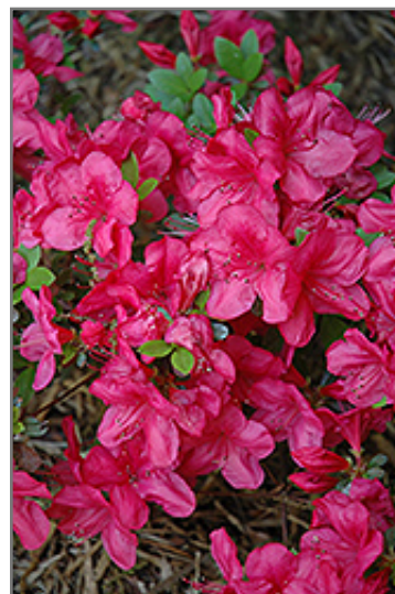
Mother's Day Azalea flowers

A riveting low growing variety with bright crimson blooms covering the branches in mid spring; showy when massed in a border or as a garden accent; absolutely must have well-drained, highly acidic and organic soil, use plenty of peat moss when planting