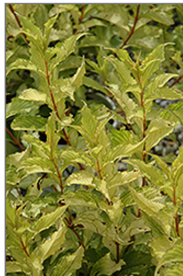
Ghost Weigela foliage