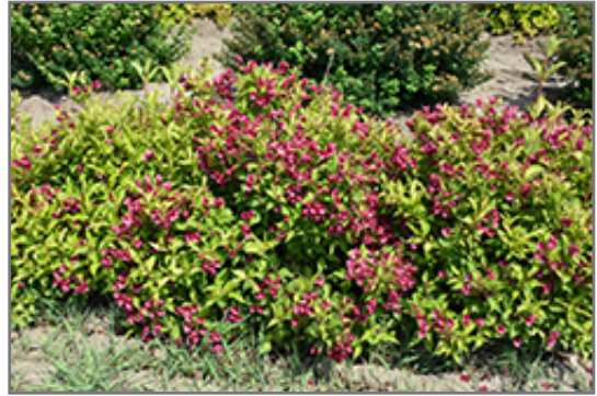
Ghost Weigela in bloom

This shrub should only be grown in full sunlight. It prefers to grow in average to moist conditions, and shouldn't be allowed to dry out. It is not particular as to soil type or pH. It is highly tolerant of urban pollution and will even thrive in inner city environments. This is a selected variety of a species not originally from North America.