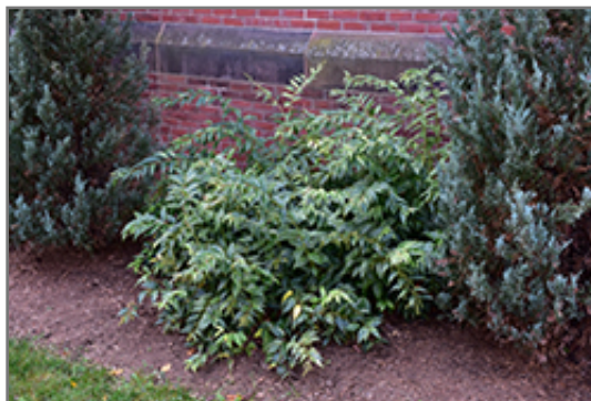
Rainbow Fetterbush