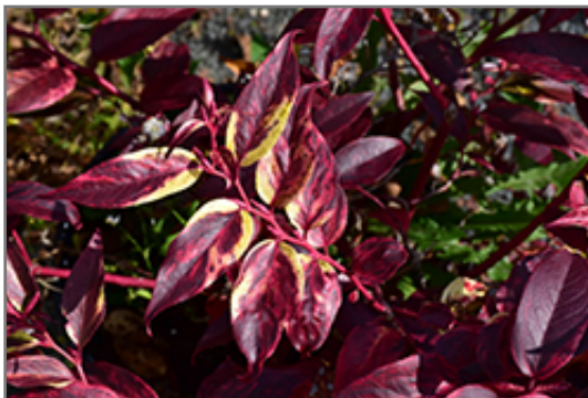
Rainbow Fetterbush in fall

Rainbow Fetterbush makes a fine choice for the outdoor landscape, but it is also well-suited for use in outdoor pots and containers. Because of its height, it is often used as a 'thriller' in the 'spiller-thriller-filler' container combination; plant it near the center of the pot, surrounded by smaller plants and those that spill over the edges. It is even sizeable enough that it can be grown alone in a suitable container. Note that when grown in a container, it may not perform exactly as indicated on the tag - this is to be expected. Also note that when growing plants in outdoor containers and baskets, they may require more frequent waterings than they would in the yard or garden.