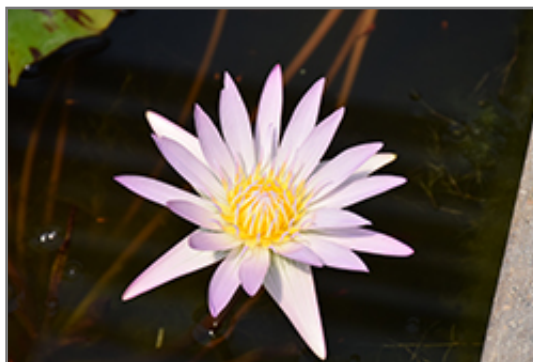
Madame Ganna Walska Tropical Water Lily flowers

Madame Ganna Walska Tropical Water Lily is ideally suited for growing in a pond, water garden or patio water container, and is recommended for the following landscape applications;