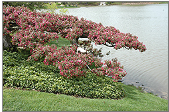
Candied Apple Flowering Crab in bloom