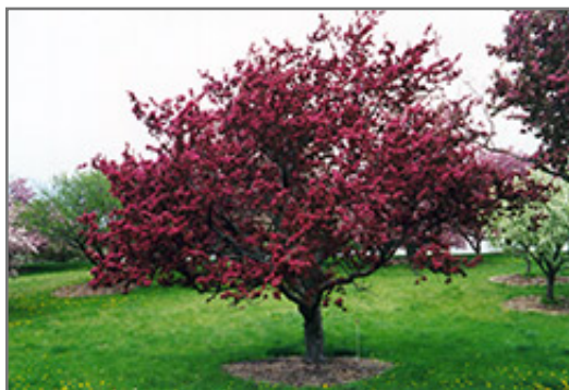
Profusion Flowering Crab in bloom