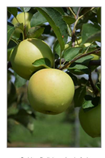
Golden Delicious Apple fruit

Golden Delicious Apple features showy clusters of lightly-scented white flowers with shell pink overtones along the branches in mid spring, which emerge from distinctive pink flower buds. It has forest green deciduous foliage. The pointy leaves turn yellow in fall. The fruits are showy chartreuse apples with yellow overtones, which are carried in abundance in mid fall. The fruit can be messy if allowed to drop on the lawn or walkways, and may require occasional clean-up.